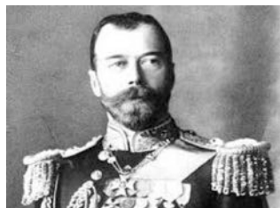
Last Czar of Russia

As little as a hundred years ago most of the countries in Europe had kings or other royal heads. Russia had the